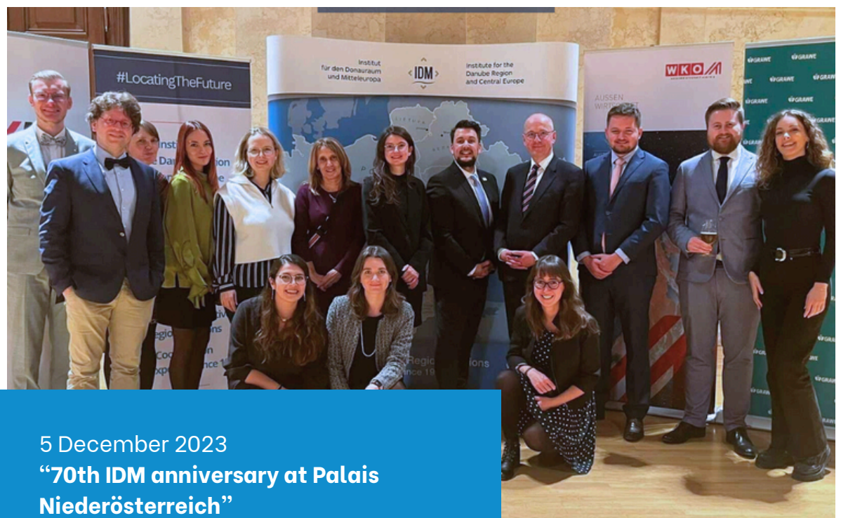
5 December 2023 “70th IDM anniversary at Palais Niederösterreich”