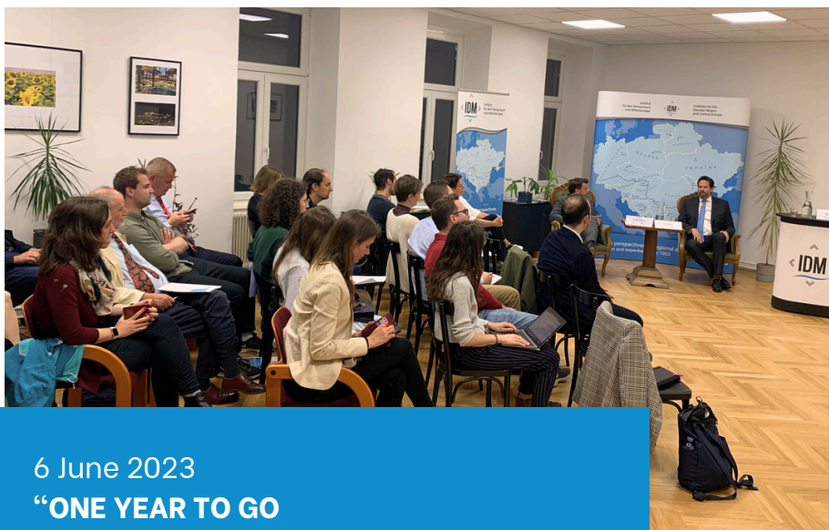
6 June 2023 “ONE YEAR TO GO European Parliamentary Elections 2024: What Themes and Narratives?”