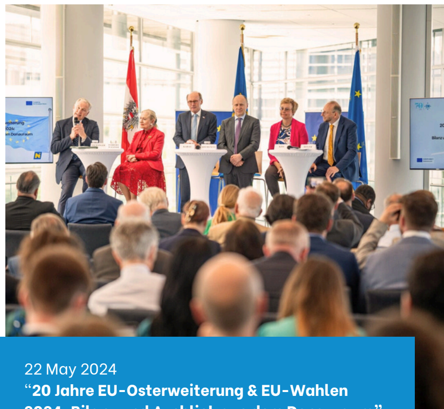
22 May 2024 “20 Jahre EU-Osterweiterung & EU-Wahlen 2024: Bilanz und Ausblick aus dem Donauraum”