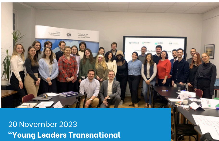
20 November 2023 “Young Leaders Transnational Reflection Event in Vienna”